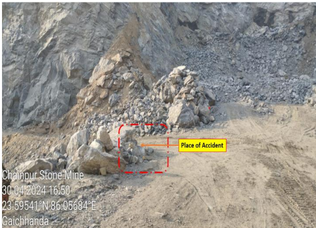
Photograph showing the site of accident